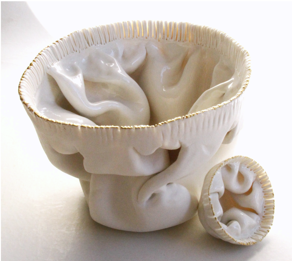
« Douce Amer »

Wall realizations for a Spa Guerlain, Bright installations for luxurious hotels, the porcelain creator also presents her creations during craft art fair in Paris and in Europe.