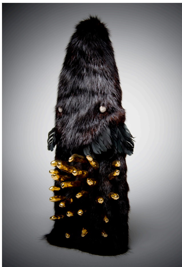
« Fétiche noir »

From 2012 till 2014, he exposes in Strasbourg, in particular in the art Fair « Résonnances ». In 2015, he receives the Prize of the Young Creation craft Art in Paris.