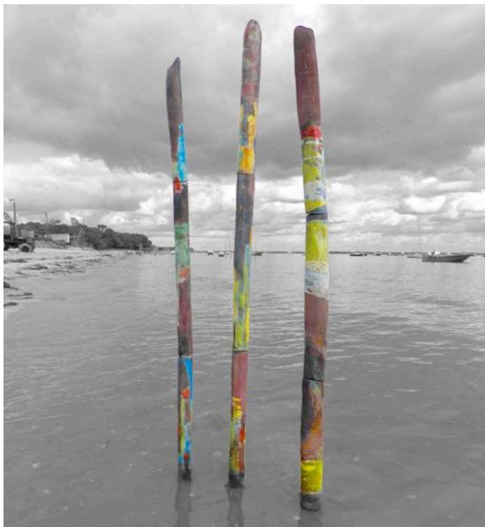
« Les totems de la mer »

Recently awarded by the councils of Charente-Maritime and Gironde, the artist presents her ceramic creations in numerous art galleries today.