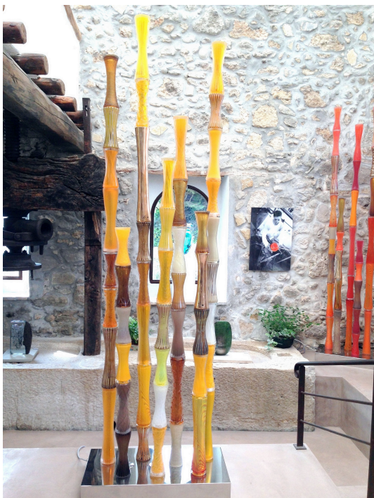
« Sculpture Bamboous »

Pierini seeks to detach himself from the object and its functional aspect to deal with a more sculptural world in a sleek, contemporary style. He is interested in the relationship between shapes, lines and colors. His approach as an artist is inspired by the observation of nature and its changing landscapes. Today, Pierini regularly shows his work in the top galleries in Europe, the United States and Canada. It is already a part of various museum collections.