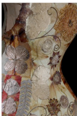
« Aphrodite »