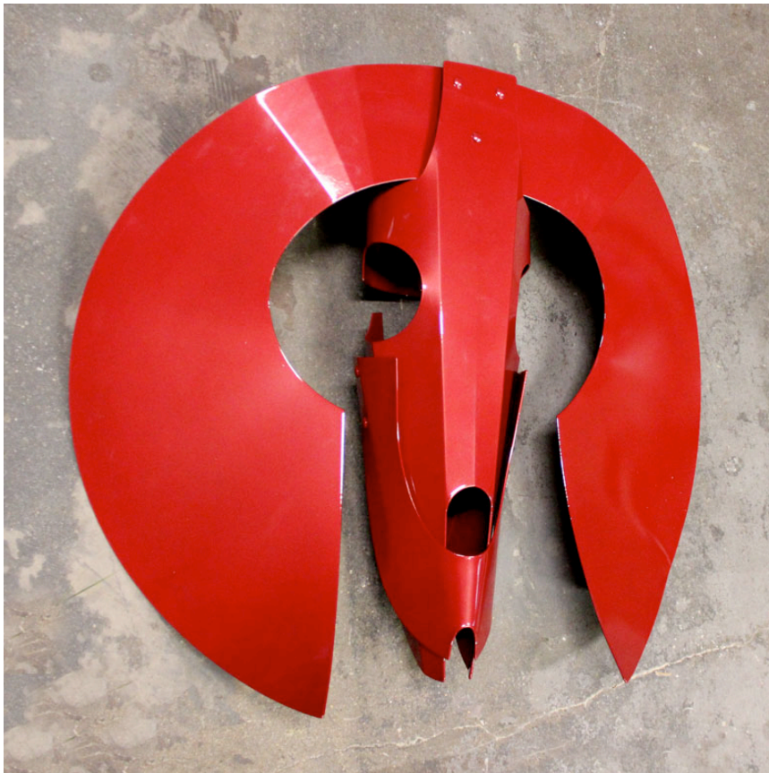
« Ovis Areas » - 80 cm – Metal Sculpture